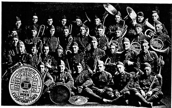
120 TH INFANTRY BAND